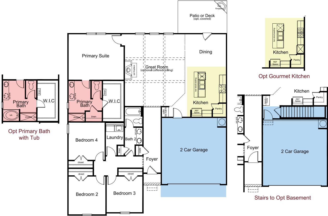
First Floor - Slab

In a continuous effort by Chafin Communities to improve the quality of your home, we reserve the right to change features, options, plans and specifications without notice. Floor plans and elevation renderings are conceptual artists' renderings for marketing purposes only. Elevations and floor plans may vary based on actual homesite and Chafin Communities may be required to build the home in a mirror image to the floor plans shown, including the garage, due to construction and building design requirements of the homesite. Significant changes may be made during or after the construction of the model homes. Chafin Communities reserves the right to modify, relocate or eliminate any or all of the features, specifications, plan utilities, design or shape thereof without notice or obligations to the purchaser. Please see your onsite sales associate for additional information.