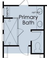
Opt Primary Bath with Enlarged Shower