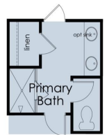
Opt Primary Bath with Shower & Linen