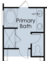
Opt Primary Bath with Shower & Tub

Optional Primary Bath Layouts Layouts vary per community, see agents for details.