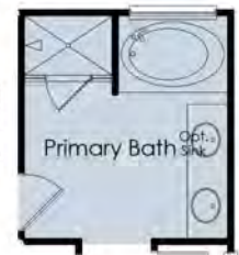
Opt Primary Bath with Tub & Shower

Optional Primary Bath Layouts Layouts vary per community see agents for details.