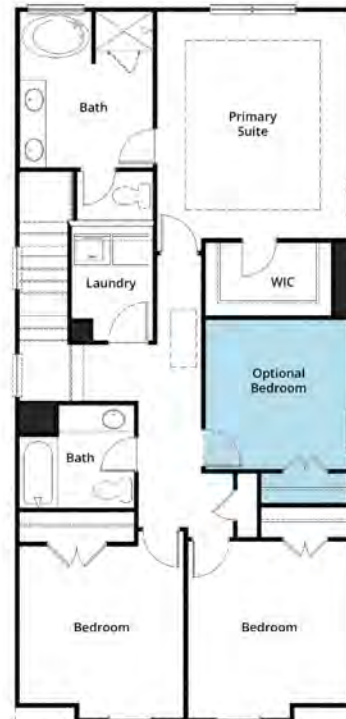
Opt 4th Bedroom - End Unit Only

Opt Enlarged Secondary Front Bedroom & Enlarged Primary Bedroom's Closet ILO Loft Up