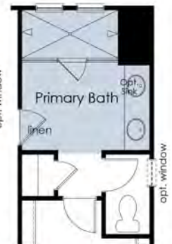
Opt Primary Bath with Enlarged Shower

In a continuous effort by Chafin Communities to improve the quality of your home, we reserve the right to change features, options, plans, and specifications without notice. Floor plans and elevation renderings are artists' concepts for marketing purposes only AND DO INCLUDE UPGRADES not available at all communities - see sales agent for details. Elevations and floor plans will vary based on actual homesite (Chafin Communities may be required to build the home in a mirror image to the floor plans shown) due to construction and/or building design requirements of the homesite. Significant changes may be made during or after the construction of the model homes. Chafin Communities reserves the right to modify, relocate or eliminate any or all of the features, specifications, plan utilities, design, or shape thereof without notice or obligations to the purchaser. Please see your onsite sales associate for additional information.