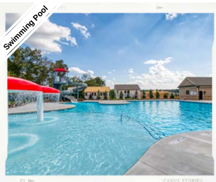
23 CANVA STORIES